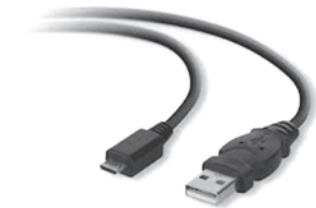
Data & communication, Charging