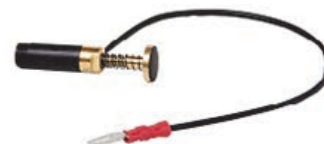
Touch Screen & Buttons